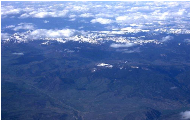
Aerial view: Mapping area in the Elk Mountains, Gunnison Co., CO

Location: Elk Mountains of the Gunnison-Crested Butte area in west-central Colorado (Gunnison County)