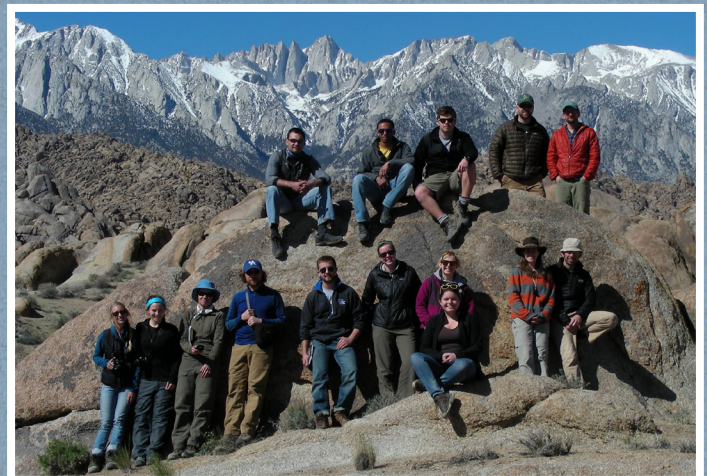
UK Geology students in the Alabama Hills at the foot of the Sierran Nevada Mountains