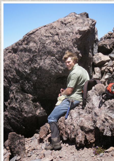
Cooper Ridge Spur, Mt. Hood, Oregon

I was impressed with the interconnectedness of the work done at the USGS -CVO. Sedimentologists work with engineers and hydrologists to understand lahars and gas geochemists work with deformation geologists to interpret behaviors of volcanoes. Overall my summer internship taught me about how science is done in the field and what the products are. I gained greater insights into techniques and methods I can use in my own work.