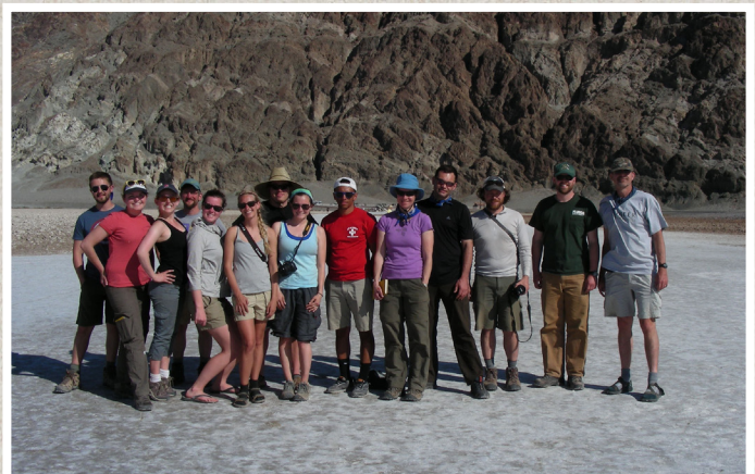
UK Geology students in Death Valley National Park, spring 2014 field trip.