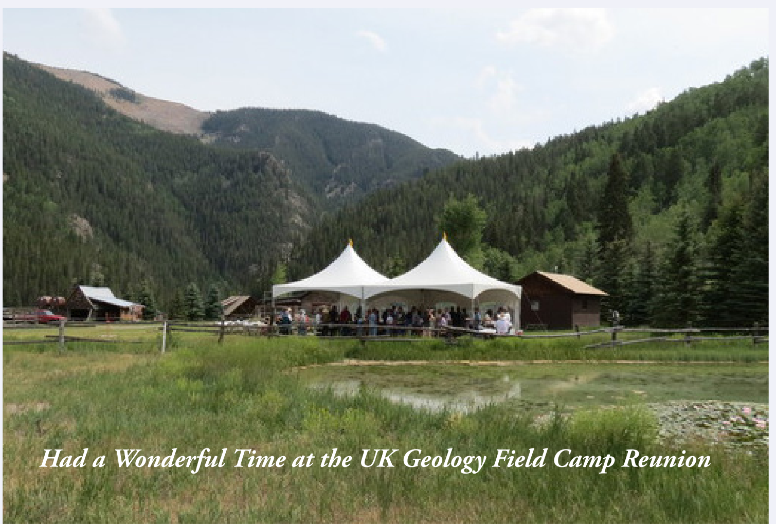
Had a Wonderful Time at the UK Geology Field Camp Reunion